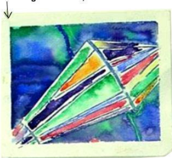
Background: Wet-on-wet Foreground: Salt, wet-on-wet