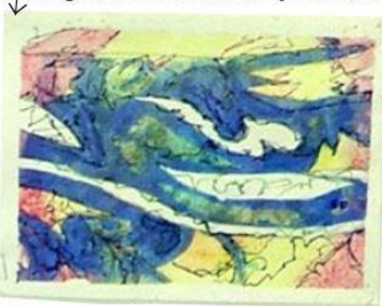
Background: Salt Foreground: Wet-on-wet, Dry Brush, Ink